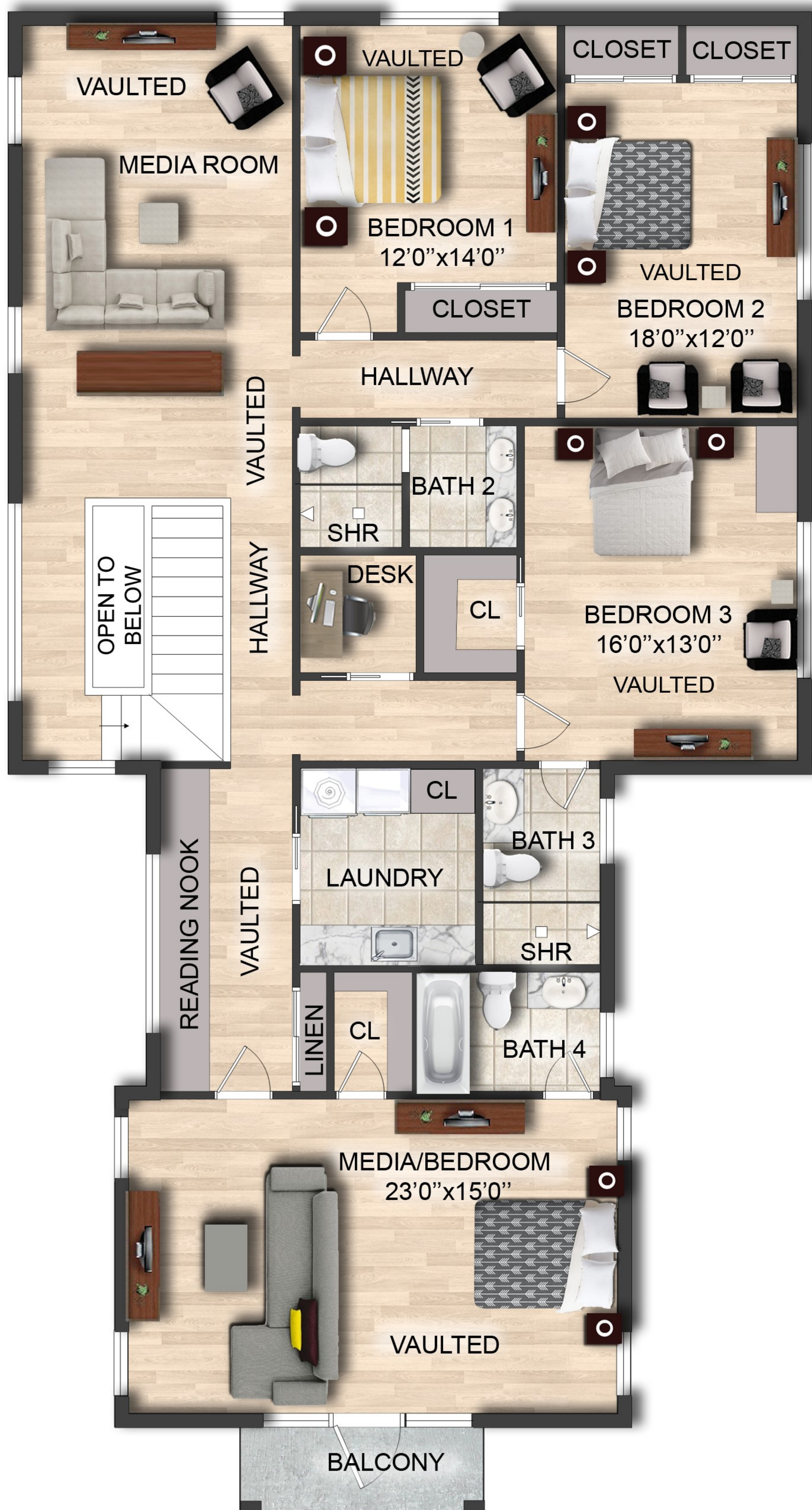
OPTION 2-SECOND FLOOR Approx. Sq Ft. 2,000